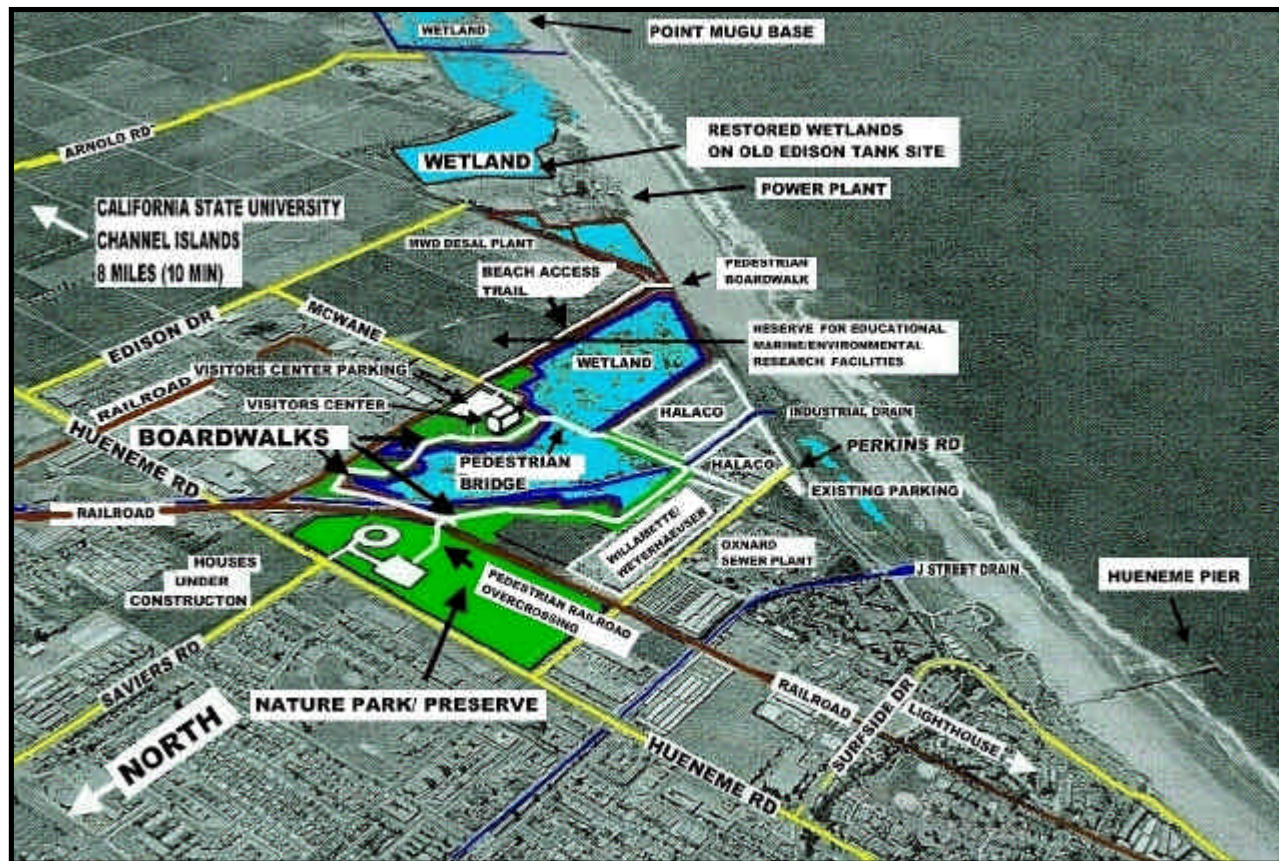
Saviers Road Design Team Proposal

Include the Saviers Road Design Team proposal in any Environmental Impact Report (EIR) prepared for the Ormond Beach area.