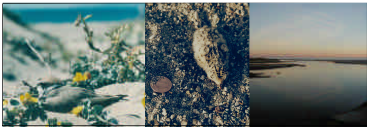
Least Tern Least Tern Chick Lagoonal Remnant