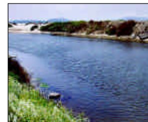
A channel at Ormond Beach

Incorporate young people into planning, restoring and maintaining the Wetlands Preserve. Utilize the wetlands as a living laboratory for educational and research purposes.