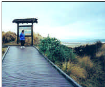
An example of what could be done here

Shut down Halaco. Remove and clean up the slagheap. Restore and buffer the degraded Ormond Beach Wetlands ecosystem.